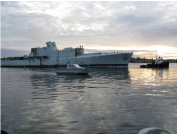
Figure 2 - ex ANNAPOLIS Departing Esquimalt Harbour 8 June 2008

Following de-commissioning ceremonies in 1996, Annapolis was berthed alongside on the Colwood side of Esquimalt Harbour and held in Reserve until she was finally paid off 2 the Navy's rolls in 1998. She remained there awaiting de-militarization prior to disposal. The demilitarization was carried out in 2001 by the Fleet Maintenance Facility in Esquimalt and involved over 8,000 hours of work over six months to remove in excess of 80 tonnes of materials (weapons, petroleum products, hazardous materials and serviceable equipment). Once completed, the ship was then turned over to Crown Assets for disposal. This proved to be a lengthy process but in the end, the Artificial Reef Society of British Columbia (ARSBC) was the successful bidder for the ship and took possession of Annapolis on the 1 st of April 2008. She left Esquimalt Harbour at sunrise on June 8, 2008 when the ARSBC towed her to Long Bay on Gambier Island in Howe Sound for final preparations before being sunk.