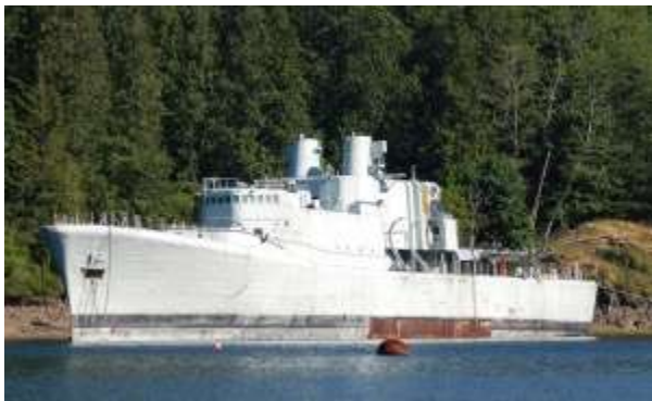
Figure 3: Annapolis off Gambier Island, Howe Sound

Canada regulates disposal at sea programmes through a permit system under the Canadian Environmental Protection Act (CEPA). Under Schedule 5 of the Act, a ship cannot be sunk until “all material that can create floating debris or other marine pollution has been removed to the maximum extent possible if, in the case of disposal, those substances would not pose a serious obstacle to fishing or navigation after being disposed of” 4 .