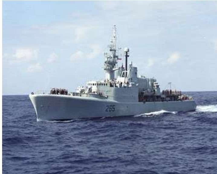
Figure 1: HMCS Annapolis