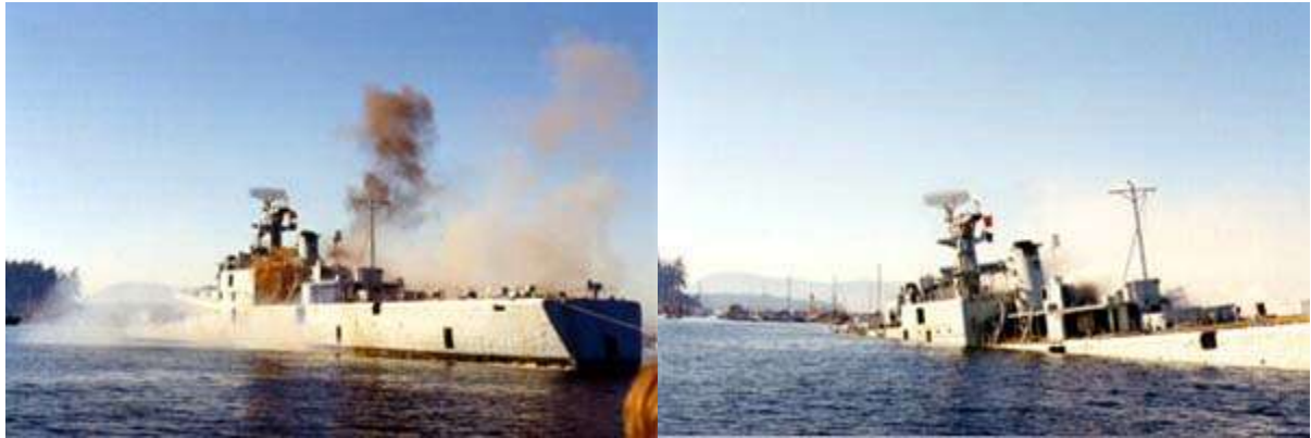
Figure 4: HMCS Mackenzie sinking September 1995

specialist divers will go down to carry out a safety inspection to ensure that all charges have detonated. Once declared safe, the site is then marked with a buoy system to clearly identify the location of the reef and facilitate tie-up moorings.