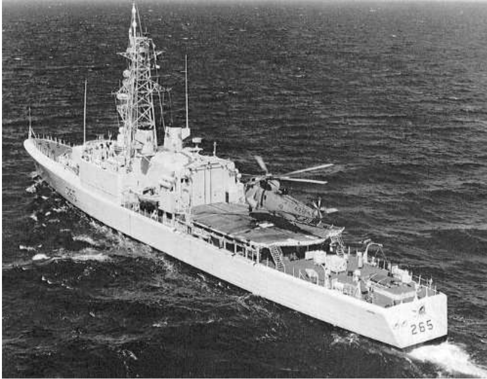
HMCS Annapolis – post DELEX/265 Conversion